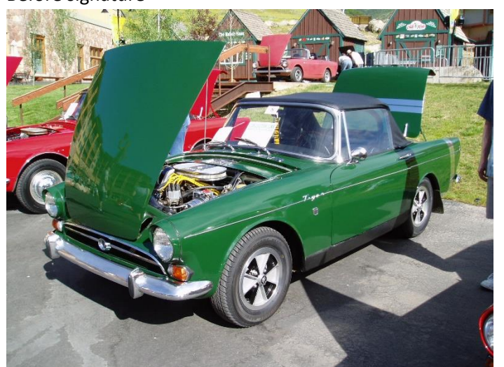
Carroll Shelby signature in progress